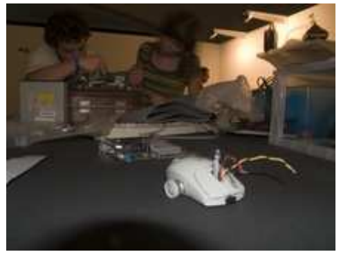
Key pin. key from keyboard, plastic base, safety pin. Robot mouse. Mouse casing, rubbers, led.