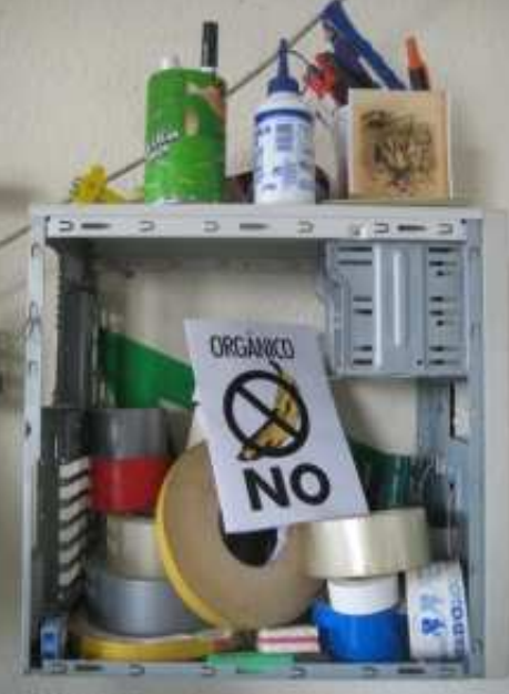
ChipBot . A motor from a mobile phone vibrator. Bookcase . CPU box.