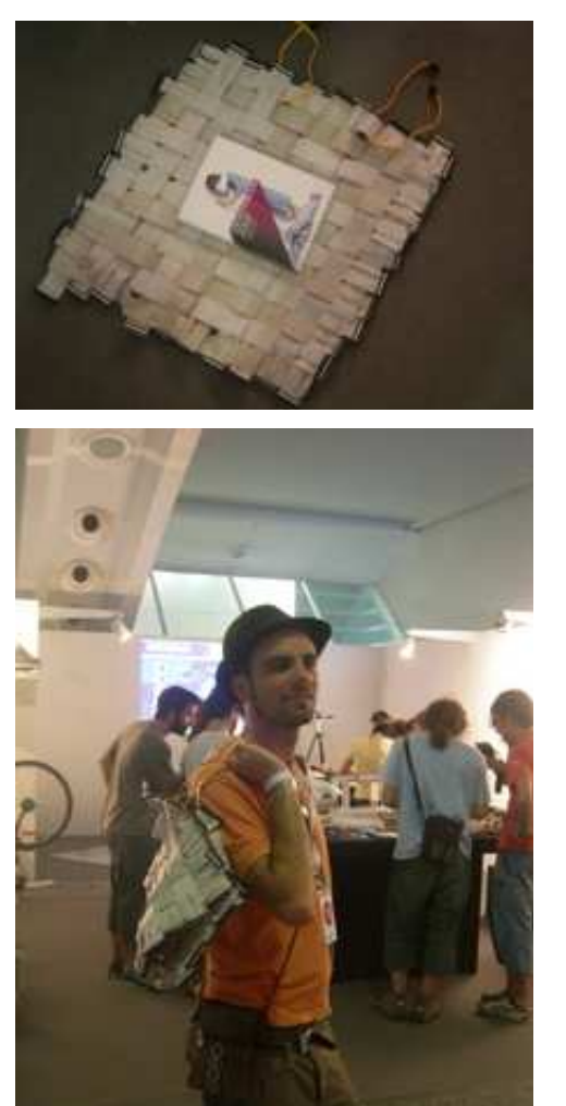
IDE bag. Twisted IDE connectors.