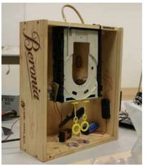
Cassette wallet . Cassette tape. Bubble machine . CD reader, 2 pomps.