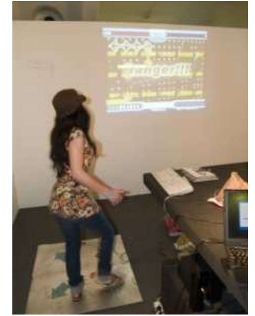
Dancing machine . Four keyboards and StepMania free software